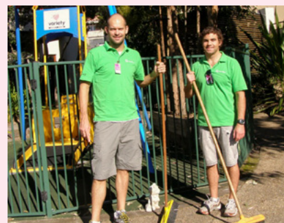
Corporate Working Bees (by application)