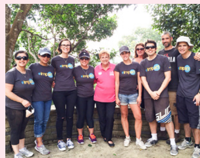
Bear Cottage Open Day (February)

For that reason, we encourage you to get involved with as many fundraising and volunteering events as you can throughout the year or alternatively you can hold your own event. Our Bear Cottage events include (but are not limited to):