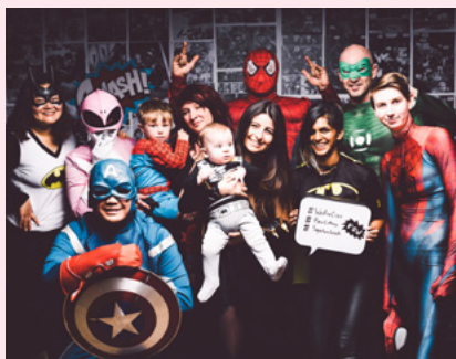
Superhero Week (July)