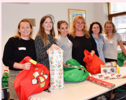
Christmas Wrapping Station (December)