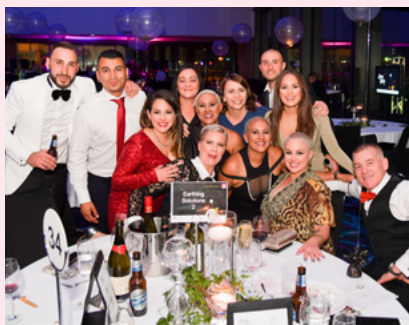
A Bear Affair Gala Ball (August)